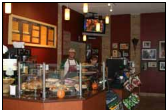
Now in a neighborhood cafe!

Besides a great variety of coffees and breakfast goodies they will also be serving soups & sandwiches. Please support our newest chamber members and treat yourself to some great coffee, or stop in for a nice lunch.